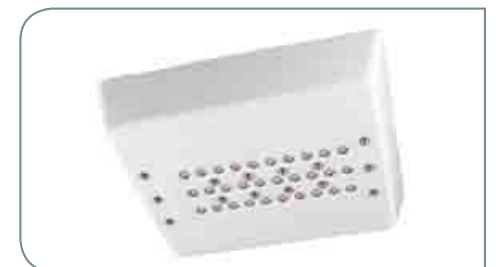
ATLAS 50W SURFACE LED TCPATLASGS30H 50W / 3500 Lumens