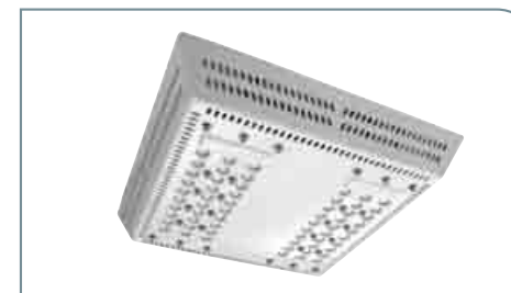
ATLAS 100W SURFACE LED TCPATLASGS60H 100W / 7600 Lumens