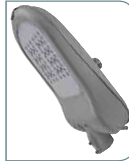
100W LED COBRA STREET LIGHT TCPCOBRA160H 100W/6700 Lumens