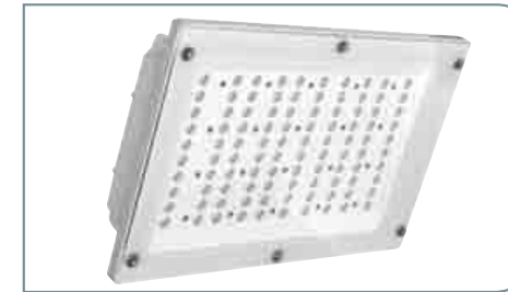
RADIANT 150W LED TCPDIANT100H 150W / 11,000 Lumens

LED surface mount and recessed luminaires provide high light output and long life which takes the worry and cost out of maintaining and replacing bulbs that burn out frequently. LED luminaires are the energy efficient replacement for incandescent, metal halide and fluorescent lamps.