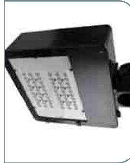
100W LED METRO STREET LIGHT TCPMETRO60H 100W/6700 Lumens

Light up the entire area with LED luminaires that are a more efficient alternative to incandescent, metal halide and linear lamp luminaires. Designed for applications that require a pole mounted fixture with long life and low maintenance.